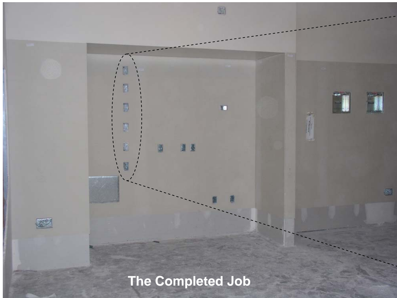
The Completed Job